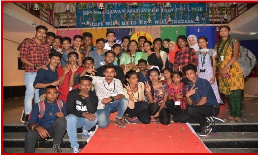
Runner up - Sambhram College, Kolar Gold Fields