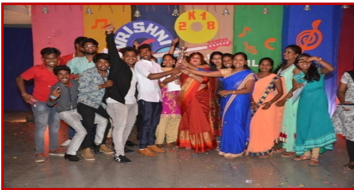
Proud Winners- First Grade College, Oorgaum, Kolar Gold Fields

The Cultural Forum students were put in charge of the registration, hosting the events as eloquent anchors, conducting the on stage and off stage events, etc. Some were allotted duties in the inaugural and valedictory ceremonies, food committee, result analysis, etc. Each on stage and off stage event had a faculty co-ordinator and student co-ordinators to conduct the various events without any hitch what so ever. First Grade College, Oorgaum, KGF won the overall trophy. The runner up position was bagged by Sambhram College, KGF.